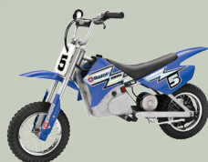
Razor® Dirt Rocket™ MX350 Electric Dirt Bike