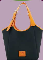
Dooney & Bourke™ Patterson Penelope