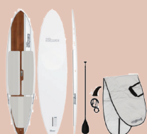
Jimmy Styks Surge Stand Up Paddleboard