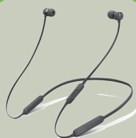
Beats by Dr. Dre™ BeatsX Wireless In-Ear Headphones