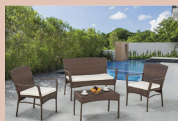
W Unlimited Outdoor Garden Patio Furniture 4-Piece Set