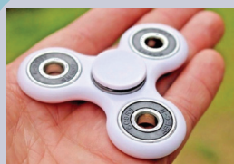
Smartworks Consumer Fidget Spinner